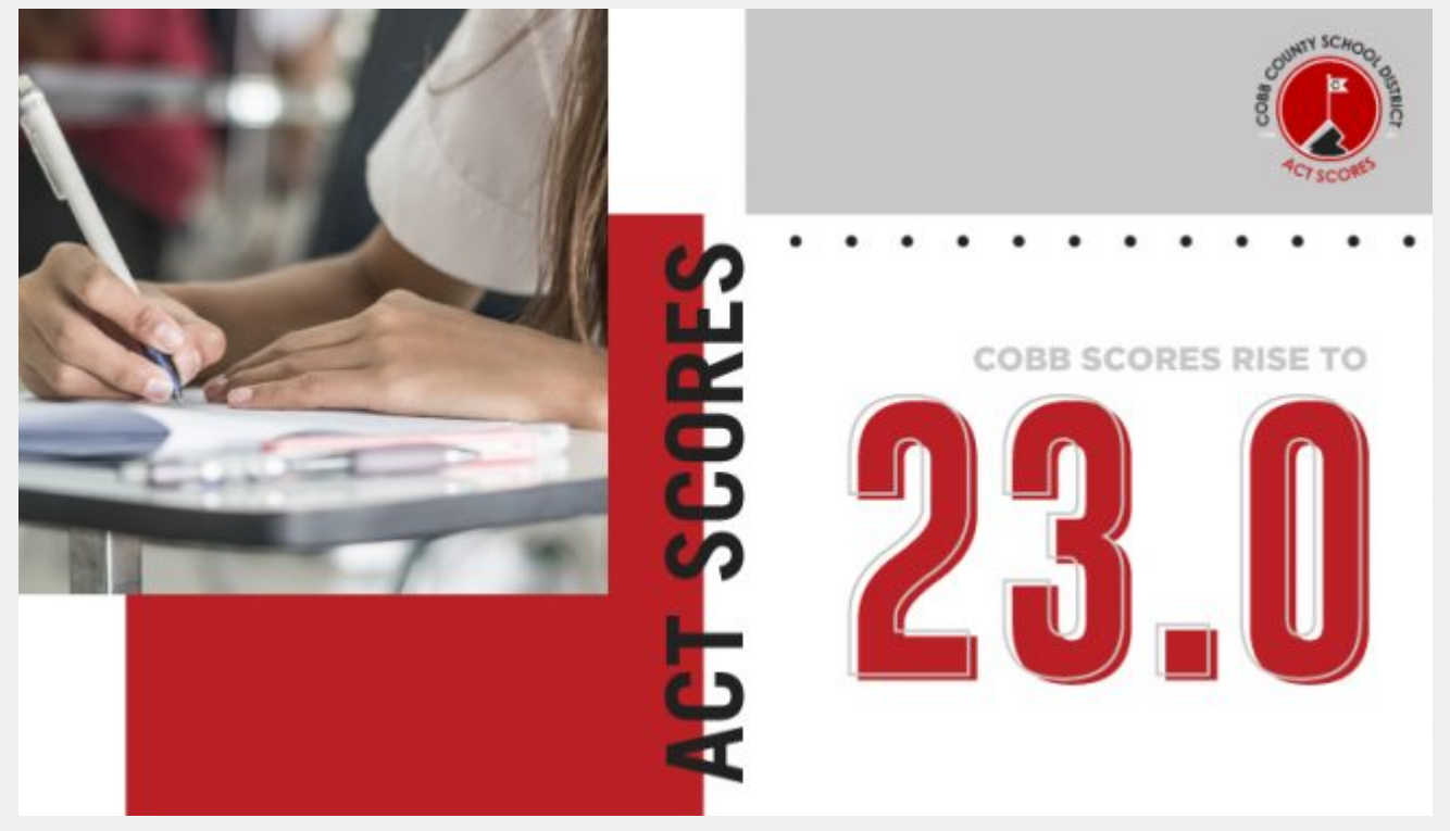
18 Cobb Students Return Perfect ACT Scores of 36

Like the SAT, graduation rate, and Georgia Milestones, students in Cobb Schools increased their scores on the ACT in 2019 and topped the Georgia and national averages.