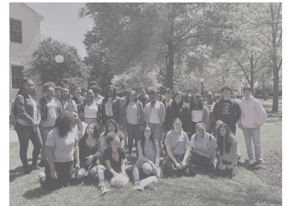
CHS students visit the University of Georgia